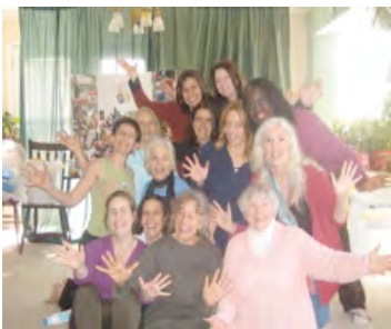
05-06 Leadership Group